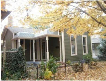
241 Henry Street Listed at $99,700

This house could be a show stopper...city view, 2600+ square feet of living space and the best neighbors around! Renovate this old home into your new one today! Call J & H Real Estate Professionals at 937-222-5885 for more information.