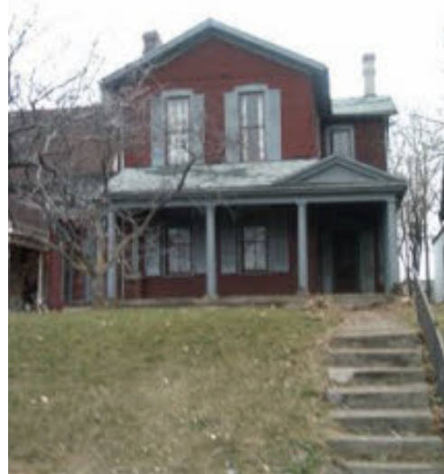
212 S. Dutoit Street Listed at $29,000