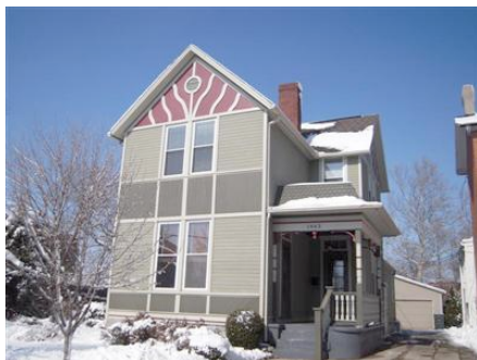
1443 E. Fourth Street Listed at $132,500