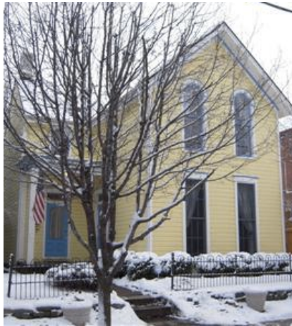
1428 E. Fourth Street Listed at $134,900

This house could be a show stopper...city view, 2600+ square feet of living space and the best neighbors around! Renovate this old home into your new one today! Call J & H Real Estate Professionals at 937-222-5885 for more information.